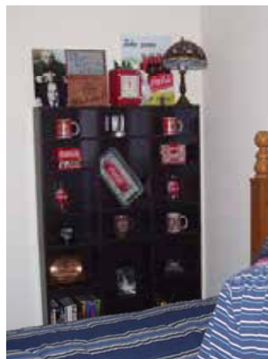
Above: Sam's impressive collection of Co-co-Cola memorabilia!